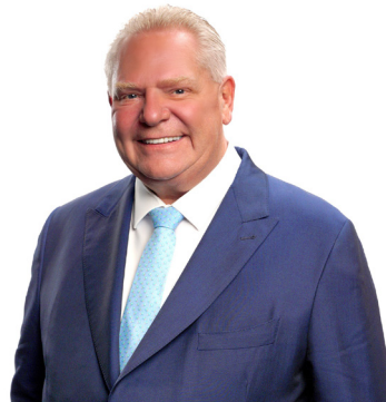
Doug Ford Premier

I wish you a productive and inspiring conference and continued success in the year ahead.